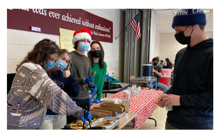
Student Goverment spreading Cheer